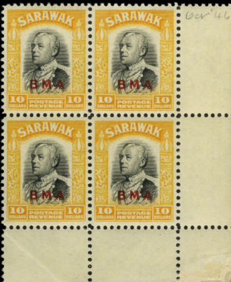
31526 (3x blocks of 4)