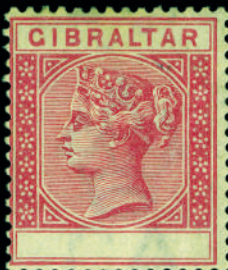
11245 (image enlarged by 138%)