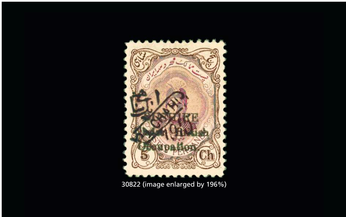
30822 (image enlarged by 196%)

— 31,607 lots worth £2,767,617 estimates —